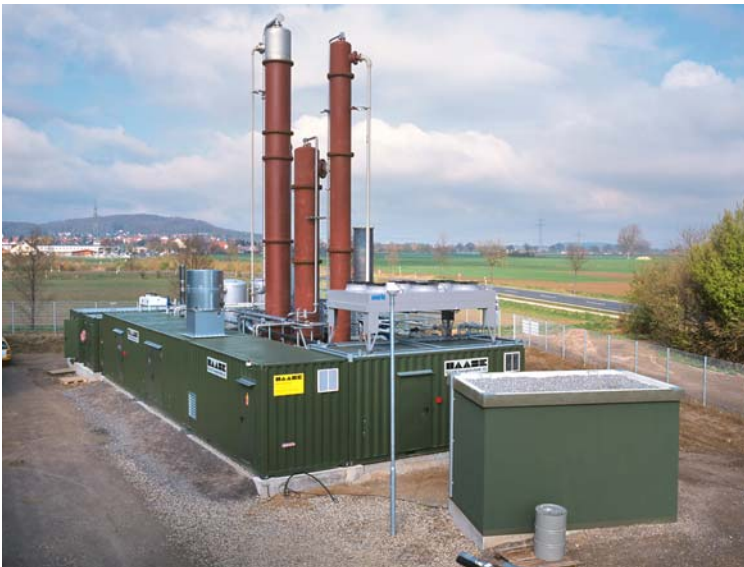
The HAASE BiogasUpgrader at Ronnenberg (Hanover, Germany) upgrades 650m 3 /h of raw biogas to biomethane with the quality of natural gas. The biomethane is fed in the local natural gas net since March 2008.

Ursula Packhäuser Phone +49 (0) 4321 878-122 ursula.packhaeuser@haase.de